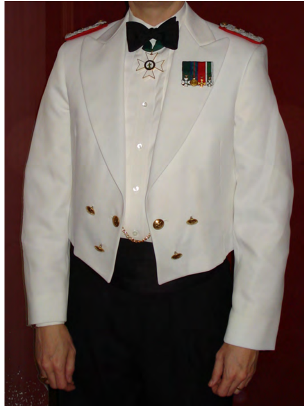
The white summer uniform of the Order.