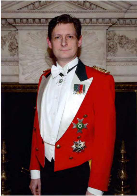
The Grand Master in the red dress uniform of the Order.